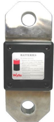
Wireless Load Link

The W3380 wireless system provides the operator with the load reading for the weight on hook. The display can monitor two load signals, boom angle, ATB and wind speed all wireless. The display has user adjustable limits. The W3380 works on both lattice and hydraulic cranes.